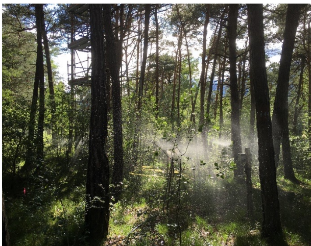
Figure 2. Irrigation system of the Long-term Irrigation Experiment in Pfyn Forest.

On Saturday 13 June, we will take the cable car to Riederalp, located at 1'925 m a.s.l., in the center of the UNESCO World Heritage , the Swiss Alps Jungfrau-Aletsch. We will visit the Nature Reserve Center Villa Cassel , enjoy a splendid view on the Aletsch, the largest Alpine glacier and hike through one of the oldest high alpine forests, the Aletsch Forest . The development of the stone pine ( Pinus cembra ) forest under climate change and the harsh environmental conditions will be discussed.