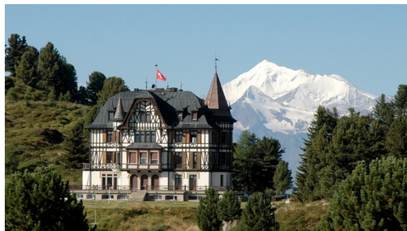
Figure 3. Nature Reserve Center Villa Cassel

At the Long-term Irrigation Experiment in Pfyn Forest , the natural precipitation of approx. 700 mm is doubled on 4 replicates since 2003 to investigate drought effects on Pinus sylvestris and gain a better understanding of the pine decline.