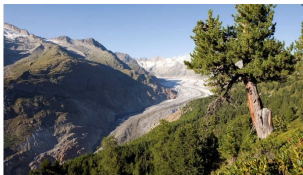
Figure 4. View on the Aletsch glacier from the Aletsch Forest