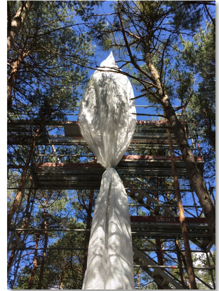
Figure 6. One of 9 scaffolds in Pfyn forest, allowing access to the top of the canopy for intensive measurements

07:30 Departure from Brig Brig – Mörel (cable car) – Riederalp – ½ hour walk to – Villa Cassel 08:30 Aletsch Forest 12:00 Villa Cassel Villa Cassel – ½ hour walk – Riederalp (cable car) – Mörel 15:00 ICP Forests Level II plot, Visp 16:00 Anticipated Departure from Visp to Zürich 20:00 Arrival Zurich main station