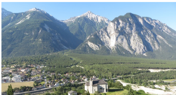
Figure 1. View on the Pine forest nature reserve Pfyn, located on a debris cone

On the nearby ICP Forests Level II plot Visp , Pinus sylvestris is heavily affected by drought, leading to tree mortality up to over 50% since 1996.