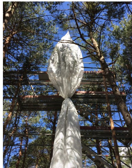
Figure 6. One of 9 scaffolds in Pfy Forest, allowing access to the top of the canopy for intensive measurements