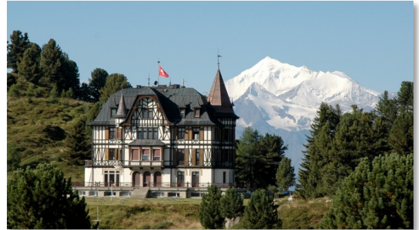
Figure 3. Nature Reserve Center Villa Cassel

At the Long-term Irrigation Experiment in Pfyn Forest , the natural precipitation of approx. 700 mm is doubled on 4 replicates since 2003 to investigate drought effects on Pinus sylvestris and gain a better understanding of the pine decline.