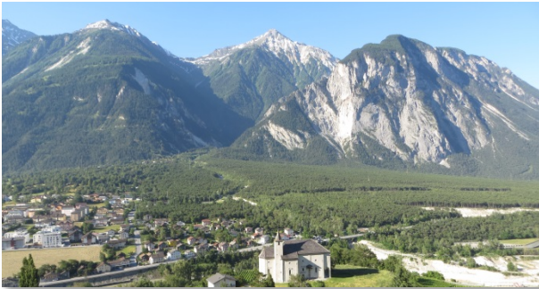
Figure 1. View on the Pine forest nature reserve Pfyn, located on a debris cone

On the nearby ICP Forests Level II plot Visp , Pinus sylvestris is heavily affected by drought, leading to tree mortality up to over 50% since 1996.